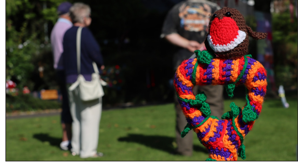
CHEEKY: A robin keeping an eye on the Magic Garden. Right: The head