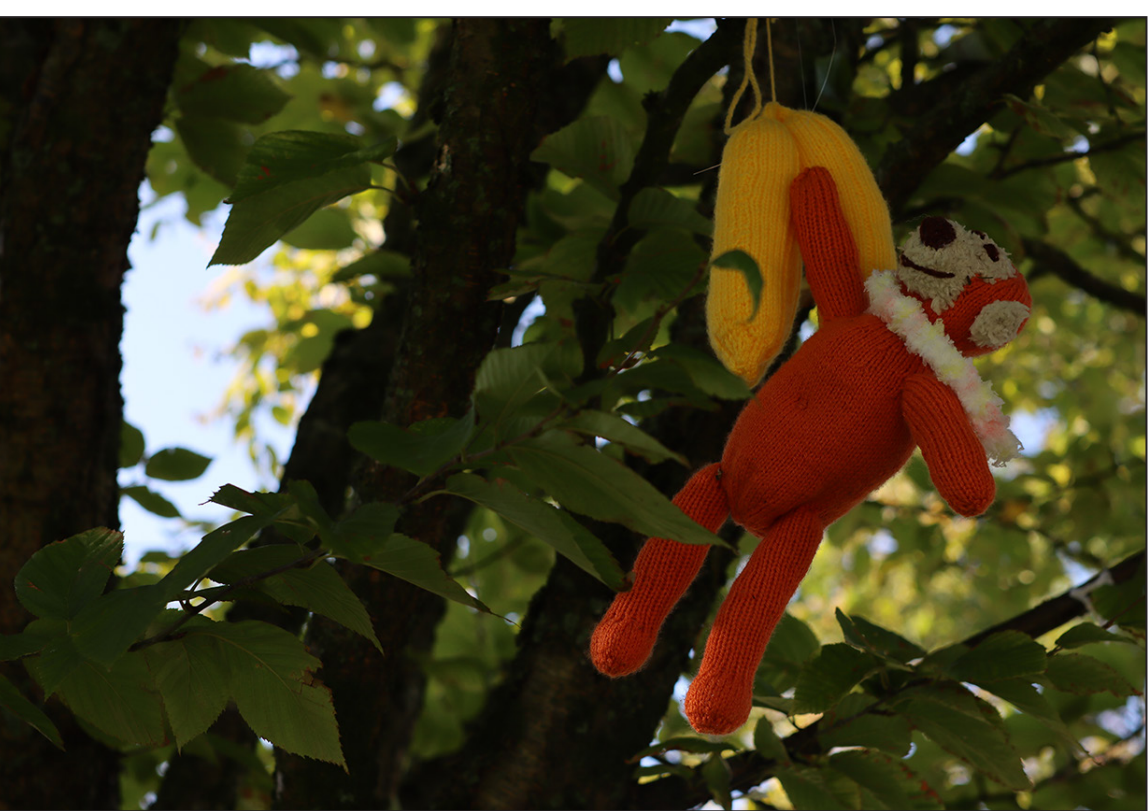
TREE: Will you spot the monkey if you visit the Magic Garden in Caerleon in aid of St David's Hospice Care