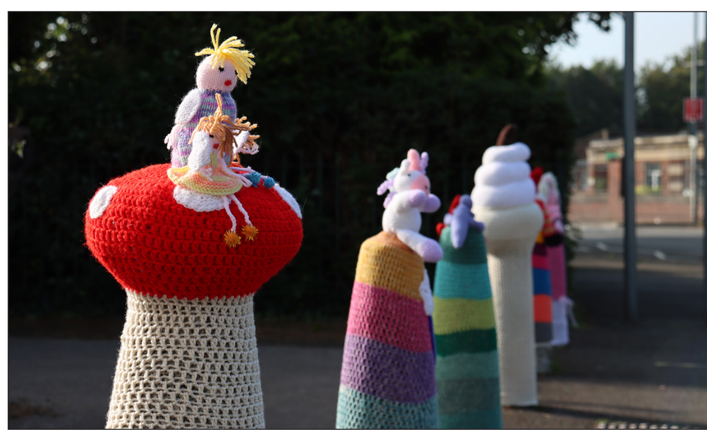
FUN: Decorated bollards. Below: The top of one of the bollards.