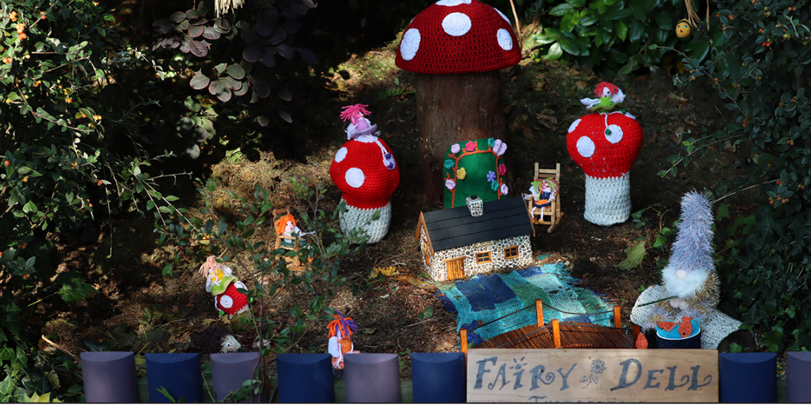
COLOURFUL: The fairy dell at the Magic Garden in Caerleon

To find out more about the group head to their Facebook page at @ proseccopurls and to donate go to www.justgiving.com/campaign/