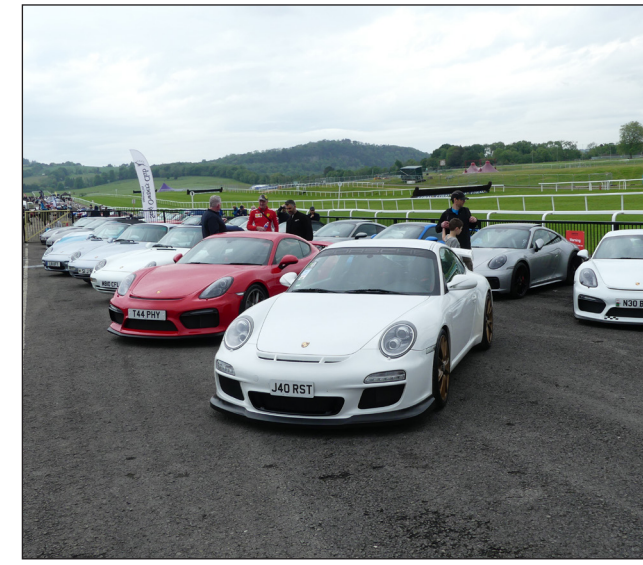
DAY OUT: Many car clubs, including this Porsche owner's club, met up to show off their wheels at the event