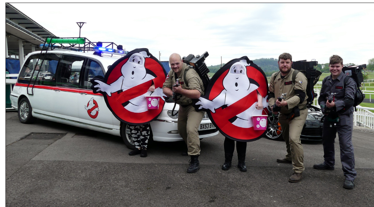
WHO YOU GONNA CALL?: The Ghostbusters from were a popular display