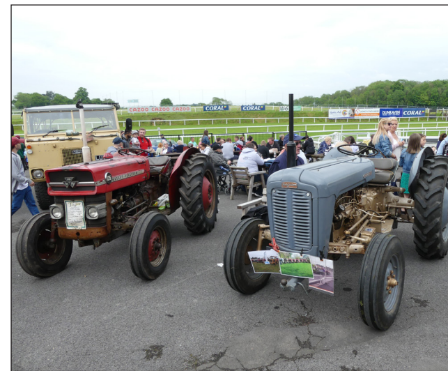
FARMING: Even tractors made an appearance at the show