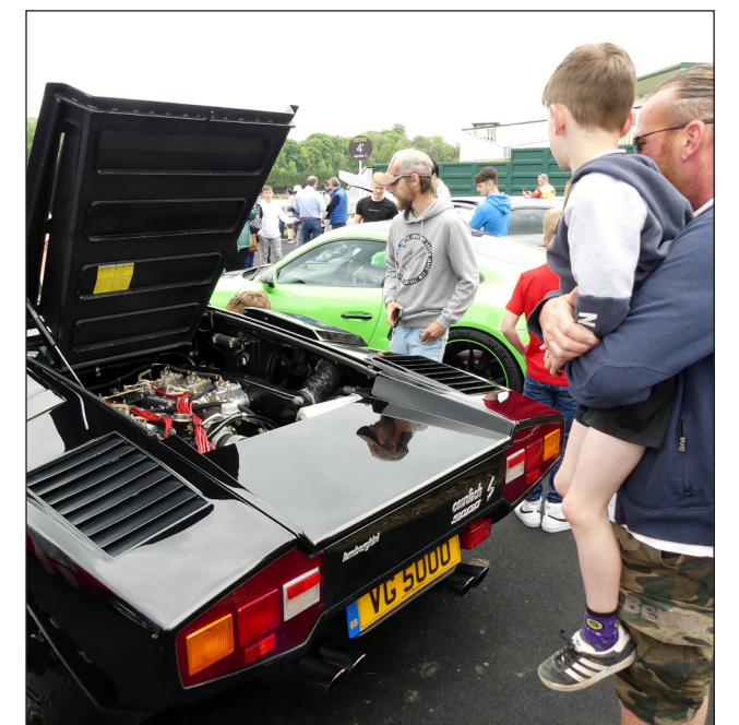
ENGINE: These two have a close look at what makes this car so special