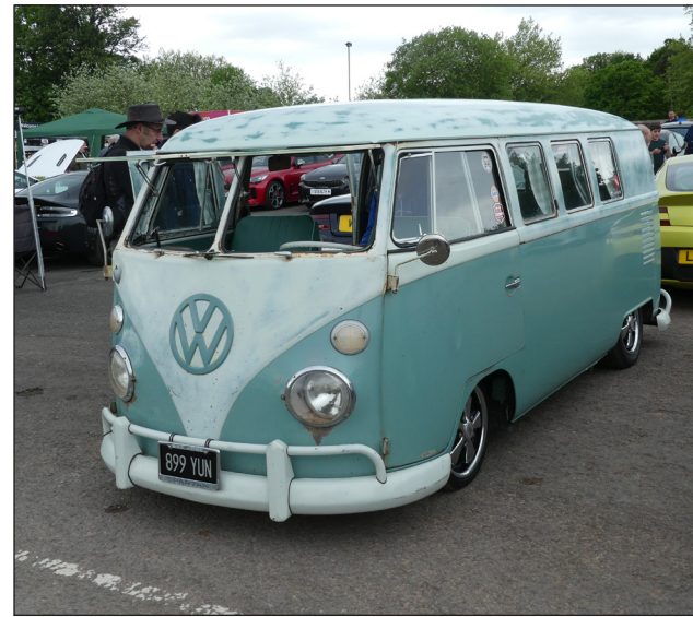
VW: There was a selection of Volkswagen camper vans on display at the show