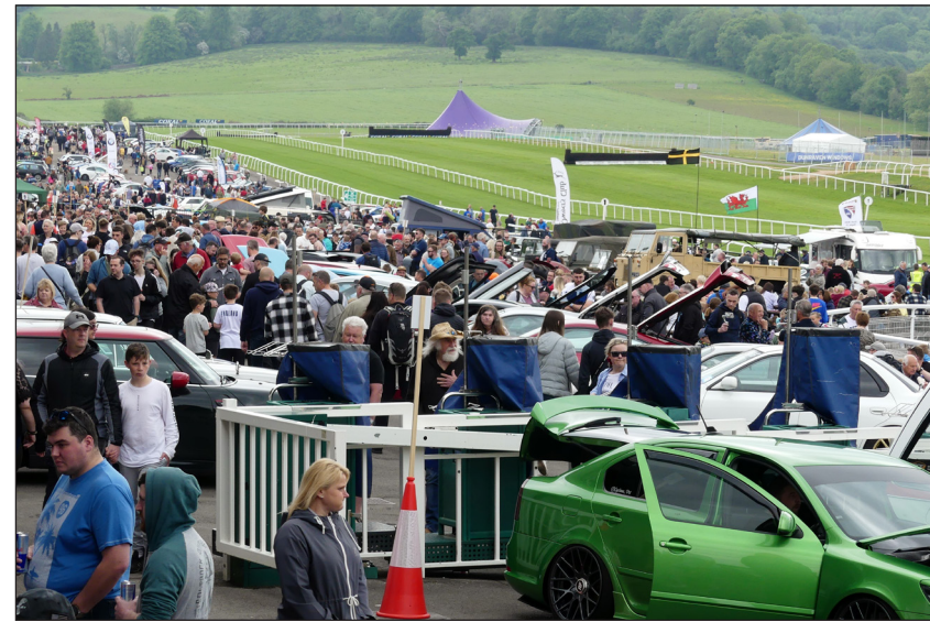
PACKED: Crowds enjoying the array of vehicles on show at Chepstow Racecourse at the weekend.