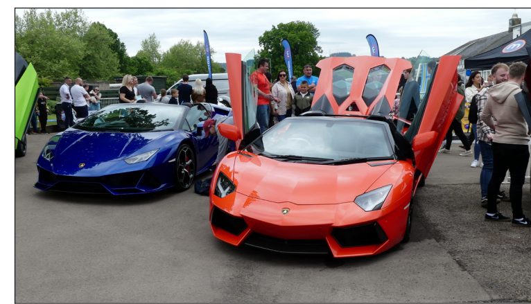
SUPERCARS: Visitors were delighted with the range of vehicles on show

"The show offered a dazzling array of vehicles on display as well as bars, street food, a kid's corner, funfair, live music, entertainment, VIP area, crafts stalls, local produce and more. It was a great day out, in a fabulous setting, enjoyed by everyone."