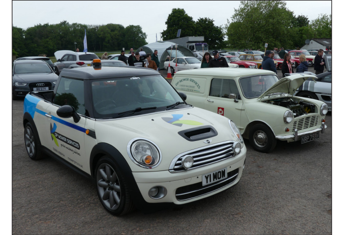
MINIS: Old and new were on show