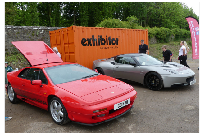
LOTUS: Just one of the hundreds of cars on show at Chepstow Racecourse at the weekend