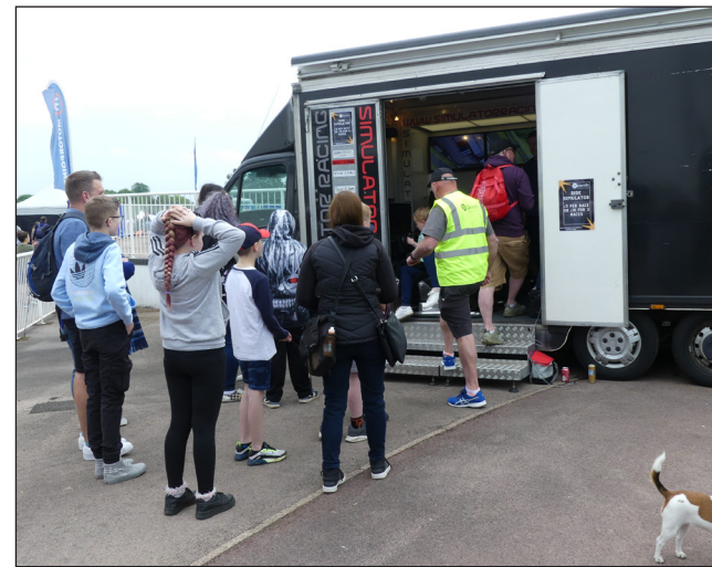
POPULAR: The queue for the driving simulator