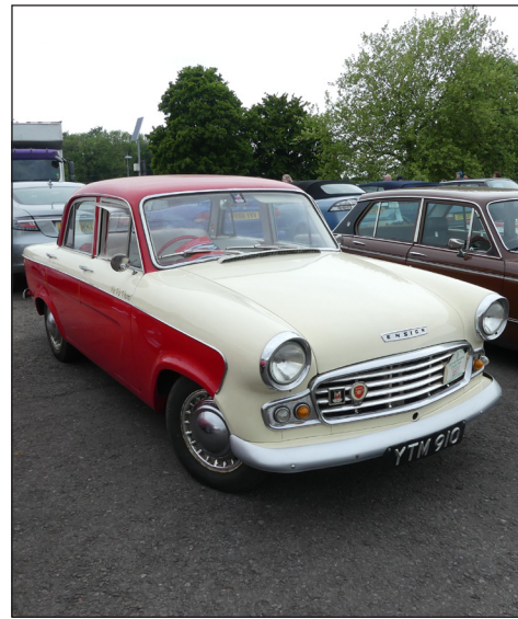
CLASSIC: A Standard Ensign