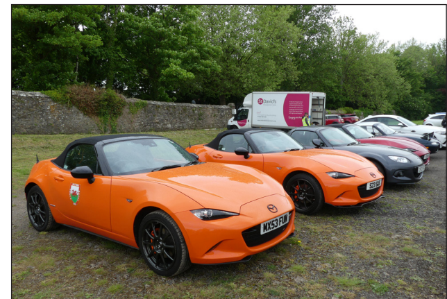
ORANGE: Two special edition 25th anniversary Mazda MX5s