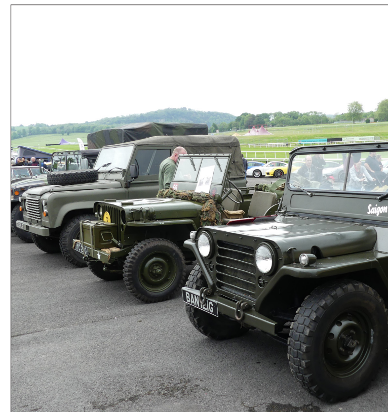
MILITARY: There really was something for everyone at the South Wales Car Show