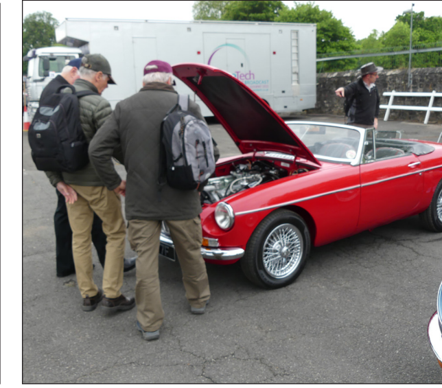
INTEREST: The crowds were able to get up close to the cars on the day