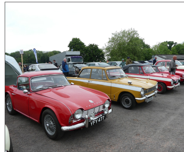
TRIUMPHS: A range of cars from this classic marque